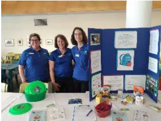
FOK at Parkland College Volunteer Fair