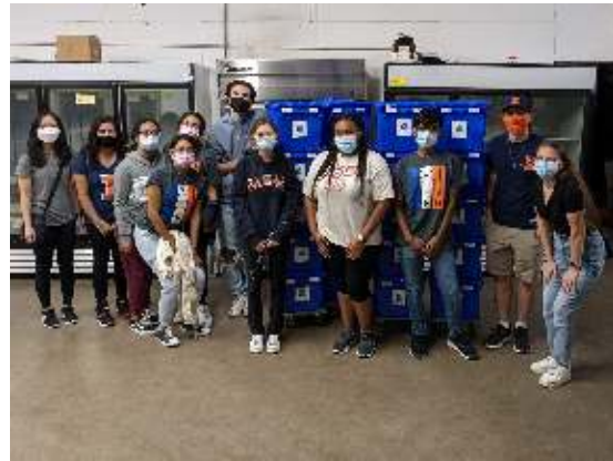
Illini Fighting Hunger