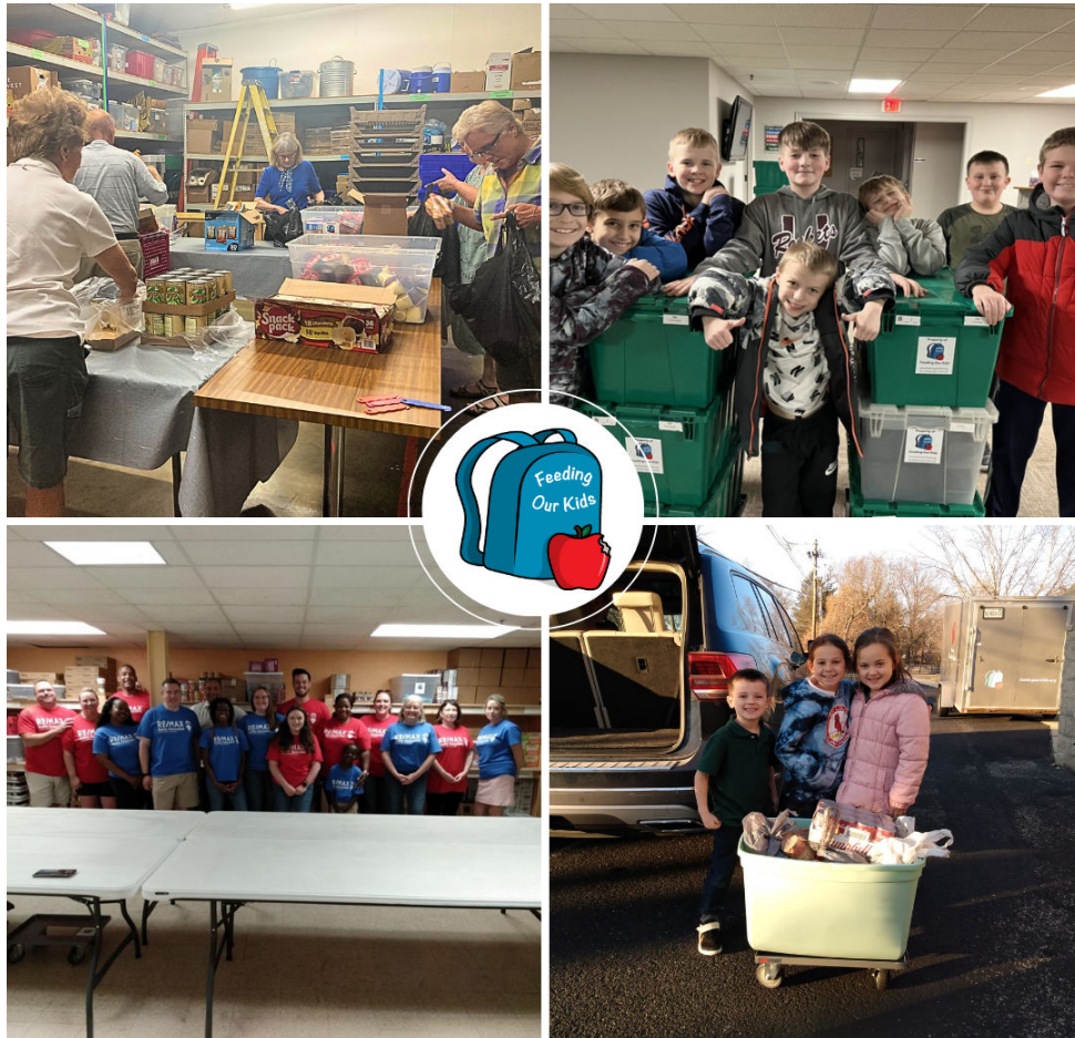
Clockwise from top left: Volunteers at Hope Center, Unity Youth Boys Basketball, St. Matthew Students, Remax Realty Associates

More than 200 people volunteered a total of 2,398 hours during 2022-2023